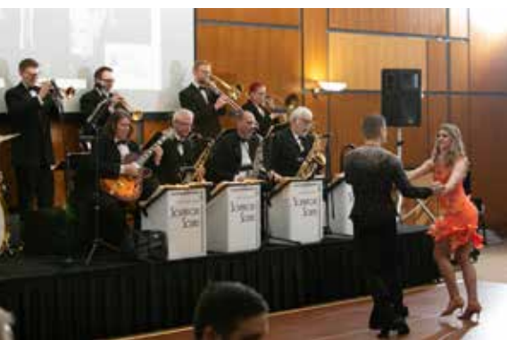
Southport Sound and dance instructors from Fred Astaire Dance Studio entertained the crowd.