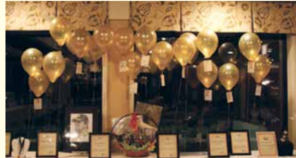
Golden balloons featuring the “wishes” of Hospice Alliance patients added a heart-warming touch to the auction tables.