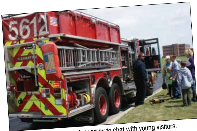
Pleasant Prairie Firemen stopped by to chat with young visitors.