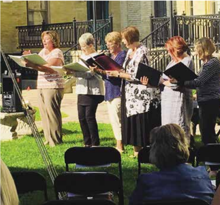
The Heritage Singers from First United Methodist Church, Kenosha, WI perform a heartfelt medley of songs entitled "I'll Fly Away" for the attendees of the Annual Service of Remembrance and Memorial Brick Dedication.

On Wednesday, June 27th, Hospice Alliance hosted our 20th annual Service of Remembrance and Memorial Brick Dedication downtown at Kenosha's own Kemper Center. Thankful for the beautiful