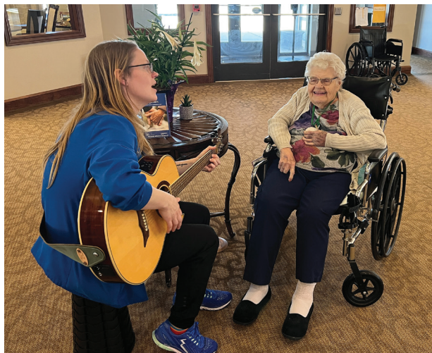
Making connections with patients, often through one-to-one sessions along with communication with family builds the trust necessary to collaborate to create a Heartbeat Project memento.

We applied for grant dollars to purchase equipment, and in July of 2023, the generous members of the Rotary Club of Kenosha West chose to support our mission. With the funds, we were able to purchase a Mac laptop, editing software, digital stethoscope, microphone, midi keyboard, CDs and sleeves. We are so grateful for their support, and it's been wonderful to offer this additional method of remembrance.