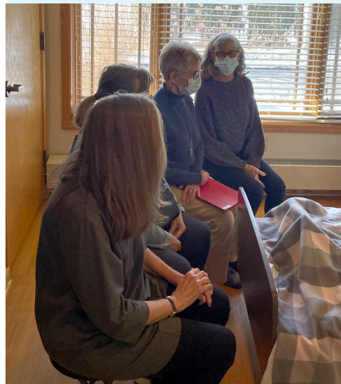
Lake County Threshold Singers share their beautiful voices with a Hospice House patient. Their gift of song benefits not only our patients but their families and loved ones who are with them during an emotional time.

be blessed" move our staff, who listen outside patient rooms. We are grateful for the time they give, and the kindness they share with those in our care.