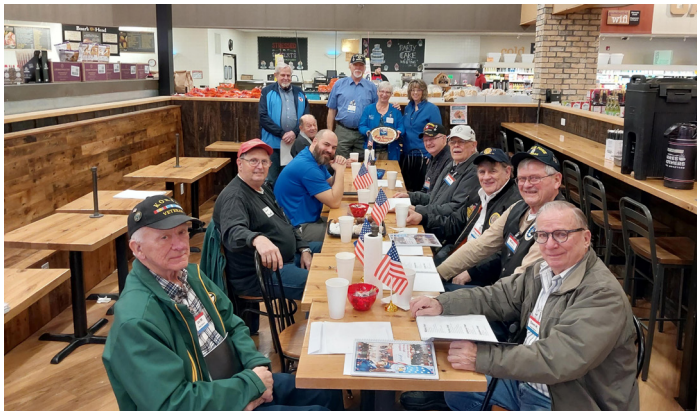
Veterans and We Honor Veterans Committee members gather at Berkot's Super Foods for coffee and comradery. Veterans of all eras and branches of service find connections at the monthly gathering.