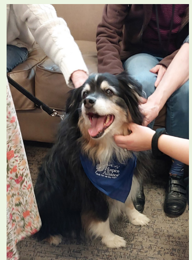
Timber, an energetic Pet Therapy pup is always ready to "sit and stay" for the pets and scratches of all those he meets. Hospice Alliance dogs (and their partners) are the most popular "people" in the room wherever they are!

Our volunteers and their companions provide Pet Therapy to individual patients, or in common spaces at senior living communities, spreading the love to many residents at once. We are always excited to welcome new Pet Therapy volunteers to brighten days in Racine and Kenosha. If interested - please contact us at (262) 652-4400.