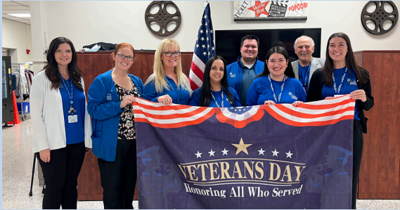
Hospice Alliance staff members and Veteran Volunteers celebrate Veterans Day with residents of The Legacy at St. Joes.

Our Volunteer Manager, Chaplains, Music Therapist, Veteran Volunteers, and Marketing Department teamed up to honor 150 veterans across 12 senior care communities over 6 days to help our partners in care honor their residents who served. The event consisted of singing patriotic songs and presenting those who served with a certificate and a Hospice Alliance challenge coin. We are proud of our commitment to caring for those who selflessly served our country and proud to be one of three hospice providers in Wisconsin to be awarded five stars for our services.