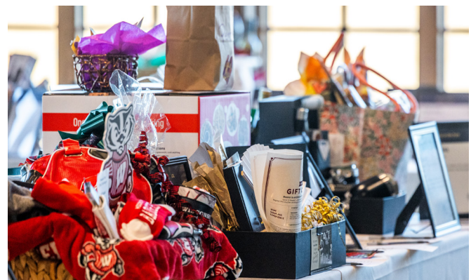
Guests browsed an array of silent auction prizes donated by the community.