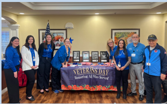
Hospice Alliance staff members and Veteran Volunteers celebrate Veterans Day with residents of Brookdale Senior Living.