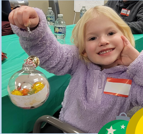
Attendee holds the holiday ornament she created.

This December, we hosted our first Holiday Memories event at Hospice Alliance. Children and teens from the community were invited to our offices to decorate a holiday ornament in memory of a loved one.