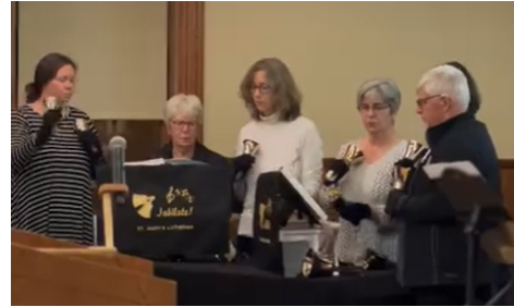
Jubilate! The St. Mary's Lutheran bell choir performs at our Ring and Remember memorial event.