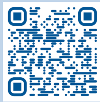
Scan to watch a brief video about Hospice Alliance's commitment to caring for those who served.