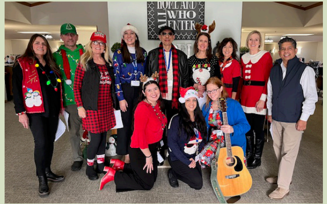
Hospice Alliance staff members and volunteers spreading holiday cheer to senior care communities across Kenosha and Racine.

The Hospice Alliance 'Jingle Bus' made stops at 11 senior care communities across Kenosha and Racine to spread holiday cheer! Thank you to our wonderful volunteers and Hospice Alliance singers!